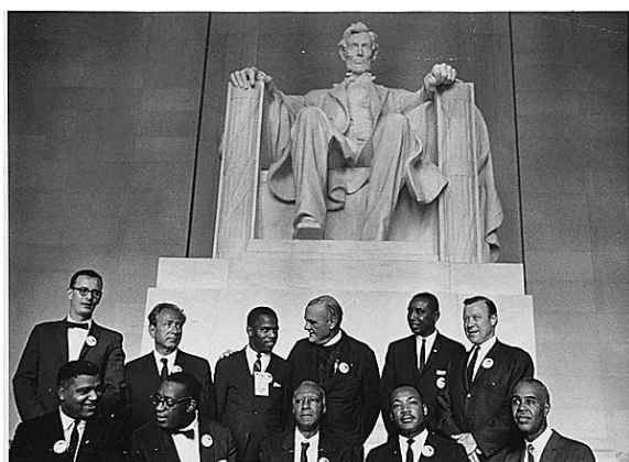
Leaders of the march posing in front of the statue of Abraham Lincoln, Lincoln Memorial, Washington DC, 08/28/1963.

During the August 28, 1963 March on Washington, Dr. Martin Luther King, Jr. delivered a speech on the steps of the Lincoln Memorial that became known as the “I Have a Dream” speech. Studying the text of the speech, a primary source document, provides us insight into the goals of the marchers, the emotions of that day, and into the social climate that precipitated Dr. King's ideas as expressed in the speech.